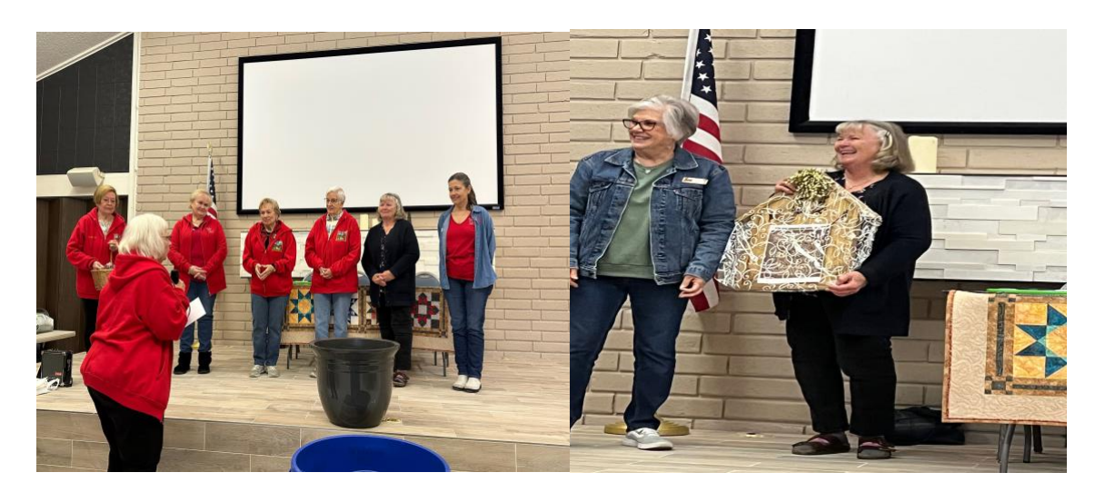
Installation of Incoming Officers